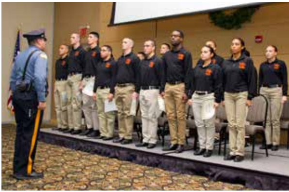
WP Pre-Police Academy Students

of Public Safety and University Police or designee in consultation with the Vice President for Student Development, or designee.