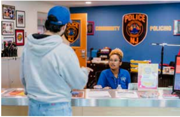
The community policing bureau in the University Commons provides information and assistance to the campus community.

The Alternative Resolution process allows a Respondent in a case to accept responsibility for their behavior and/or potential harm. A Respondent who fully participates in the process will not be charged with a violation of University Policy. The Alternative Resolution process is designed to eliminate the Prohibited Conduct, prevent its recurrence, and remedy its effects in a manner that meets the needs of the Complainant while still maintaining the safety of the overall campus community.