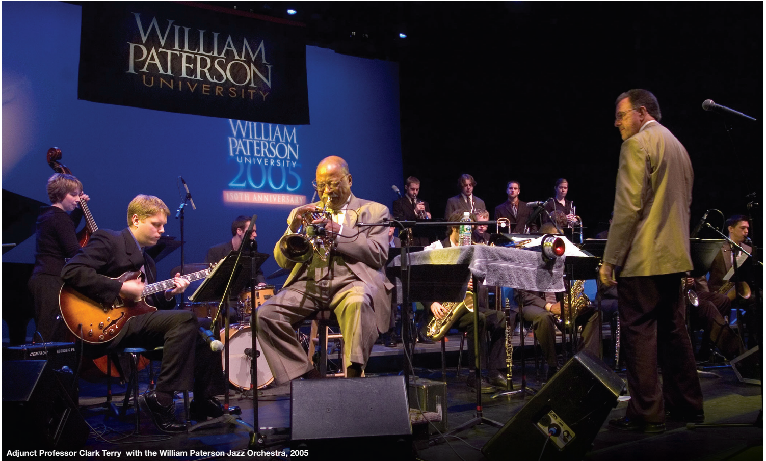
Adjunct Professor Clark Terry with the William Paterson Jazz Orchestra, 2005