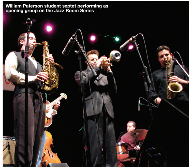
William Paterson student septet performing as opening group on the Jazz Room Series