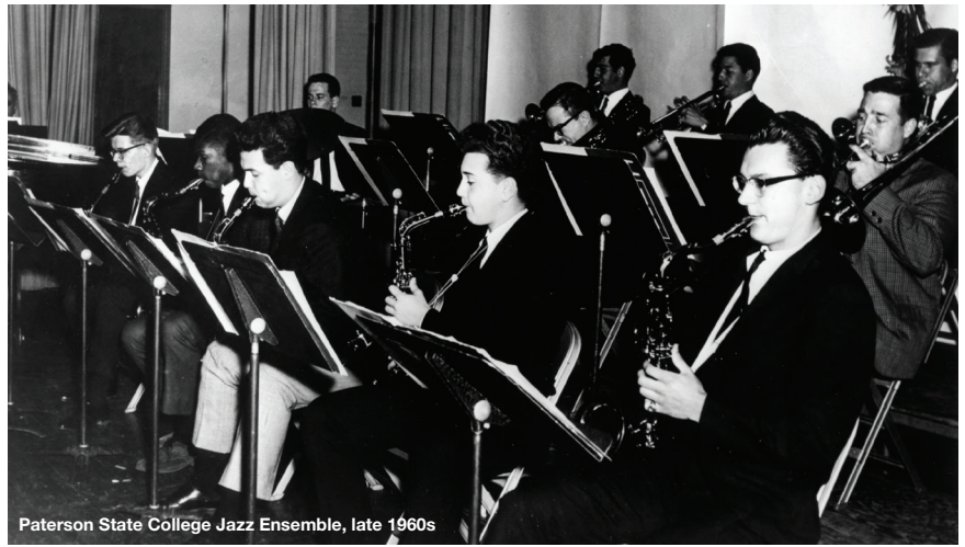
Paterson State College Jazz Ensemble, late 1960s