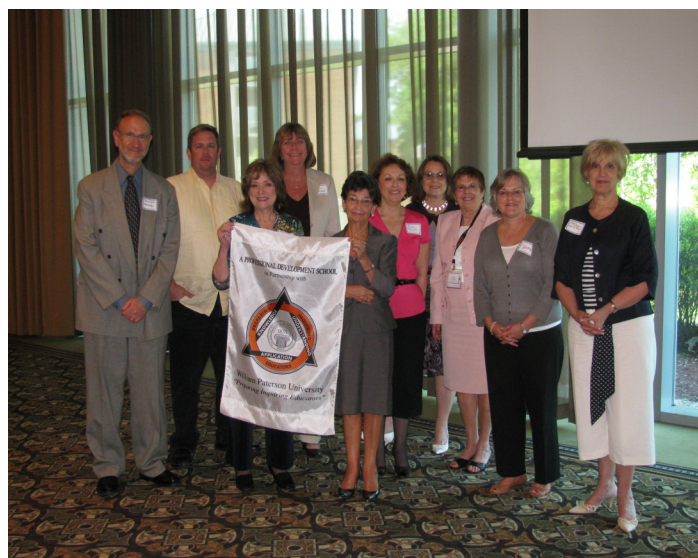
PDS banners presented to West Milford superintendent, teachers, and administrators