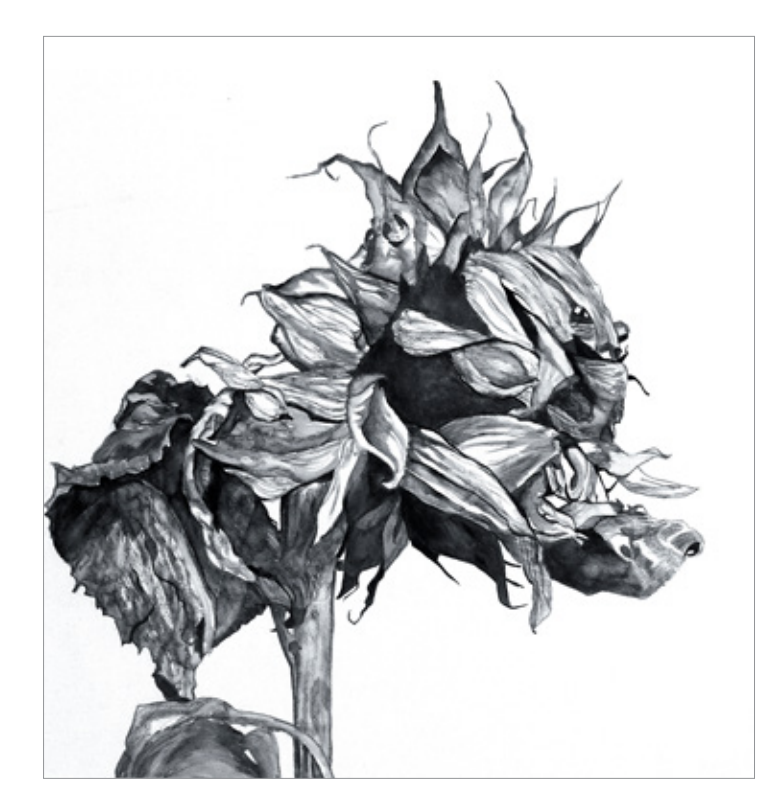
Four Weeks After 30 x 30 Inches, paper size 39 x 39 Inches, frame size Ink on Arches Watercolor Paper 2016