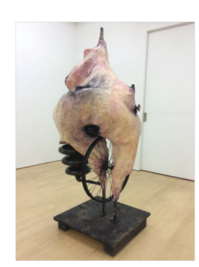
Automata Bile Distillor 22 x 28 x 63 Inches Mixed Media 2015

Originally from Stamford, Connecticut, Eleanor is now located in Oak Ridge, NJ